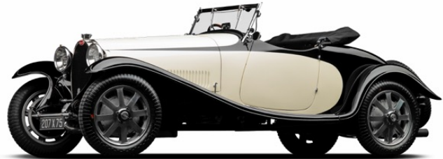
Peter Mullin's 1929 Bugatti Type 43/44 Roadster Luxe

Please click on the photos below to be taken directly to our website for more information on our October "Featured Vehicles"