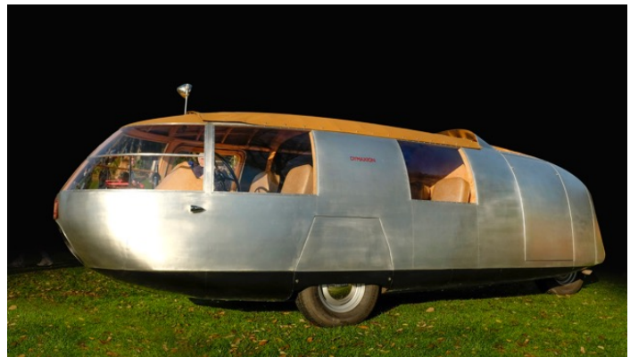
Lane Motor Museum's 1933 Dymaxion Replica